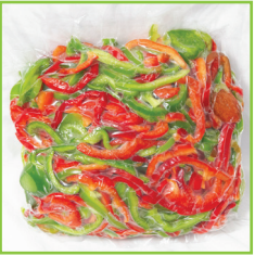
Peppers - Green & Red - Julienne Item #: 11886 Size: 5 LB