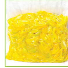
Peppers - Yellow - Strips Item #: 2821 Size: 5 LB