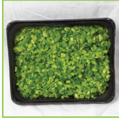
Peppers - Green - Diced - 1/2" Item #: 2724 Size: 5 LB