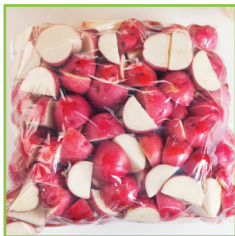
Potatoes - Red B - Quartered Item #: 2441 Size: 10 LB / 3 CT