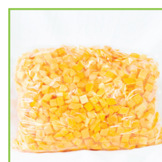
Squash - Butternut - Diced - 1/2" Item #: 14563 Size: 5 LB / 2 CT