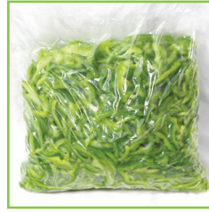
Peppers - Green - Strips - 1/4" Item #: 12711 Size: 5 LB