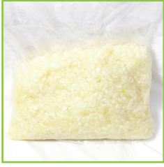
Onions - Yellow - Diced - 3/8" Item #: 2389 Size: 5 LB