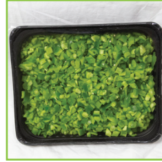
Peppers - Green - Diced - 3/8" Item #: 12724 Size: 5 LB