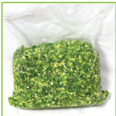
Peppers - Jalapeno - Diced - w/ Seeds - 1/8" Item #: 18048 Size: 5 LB