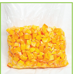
Squash - Butternut - Diced - 3/4" Item #: 2787 Size: 5 LB