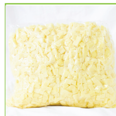
Potatoes - Diced - 1/2" Item #: 2437 Size: 10 LB / 3 CT