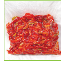
Peppers - Red - Strips Item #: 12712 Size: 5 LB